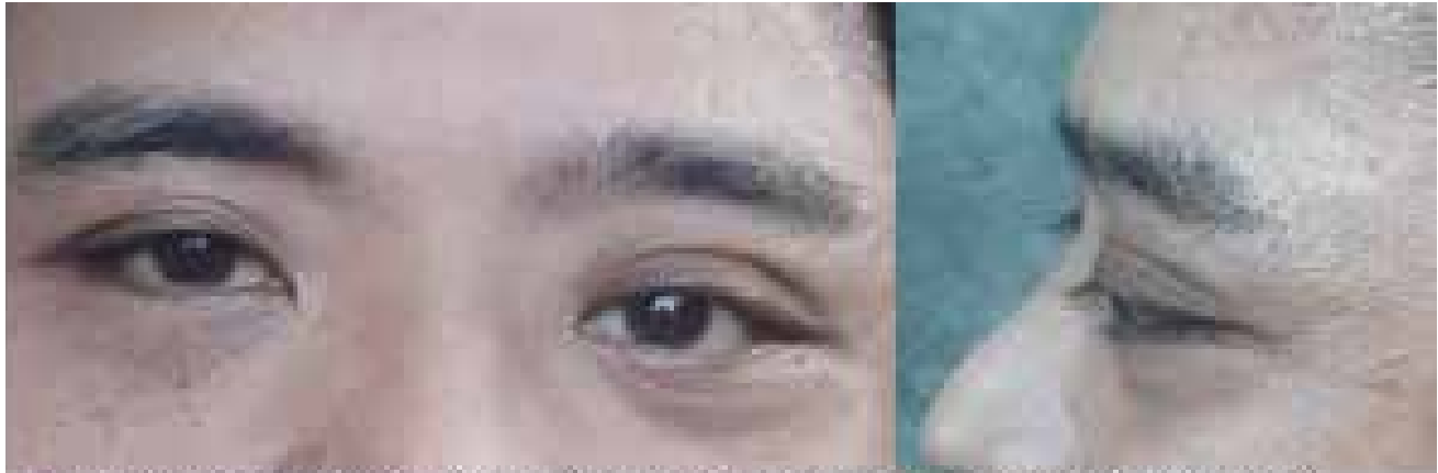
Figure 5. Three months post surgery with reconstruction of the craniectomy defect and orbital rim