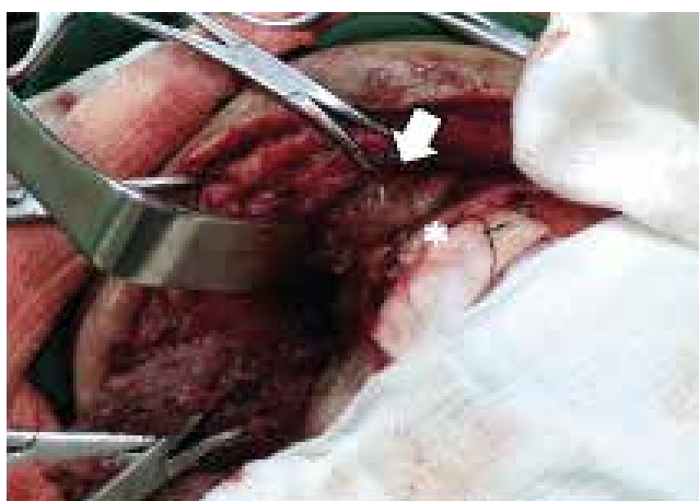
Figure 4. Intraoperatively, the affected frontal bone (*) just above the superior orbital rim was brittle and contained jelly-like material (white arrow) when removed.